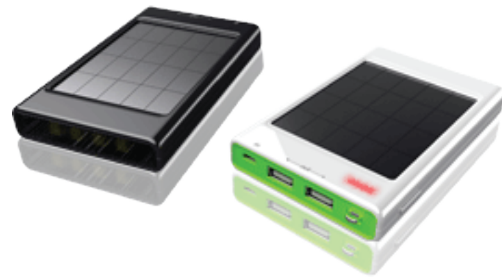
Components in Package : SLPD-01 + USB cable + Product Manual

Solar Charge Battery Pack Quick Smart Charge Flashlight