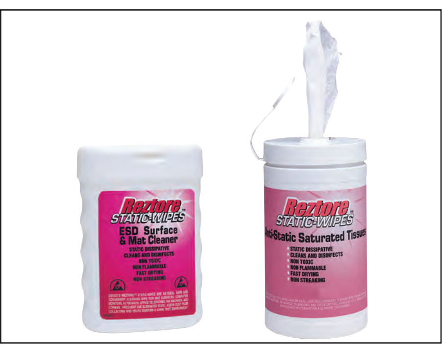
Figure 1. Reztore™ Static-Wipes: 60 Wipes in an Anti-Static Canister 160 Wipes in an Anti-Static Canister